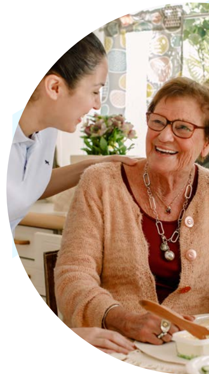
Illustration is for financial professional educational purposes only and assumes a borrower aged 62 who resides in Tennessee and an adjustable interest rate, with an initial rate of 6.00% (+0.50% MIP), and financed fees of approximately 3.76% of the home value. Rate quote generated on 10/24/2024. Rates are rounded to the nearest 0.125% and are subject to change.